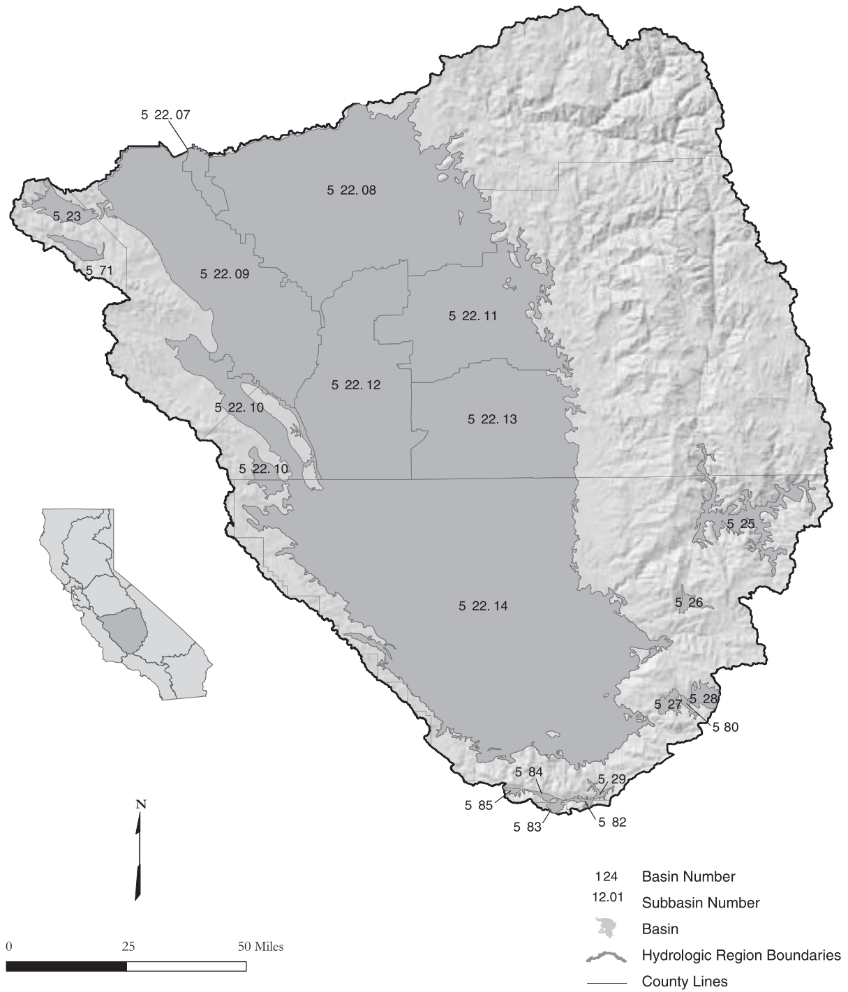
Figure 37 Tulare Lake Hydrologic Region